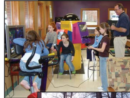
Community Activities Center

The CAC is the hub for recreation, youth and family programs. The CAC is available for family events with a pool table, foosball, large screen TV, children's play/learning center, library, video games, piano, etc. Discounted tickets to area attractions are also available. The CAC serves as the check in for outdoor recreation equipment rental (grills, canopies, camping equipment, etc.), Marina and FamCamp.