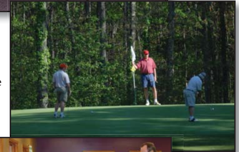
Arnold Golf Course

Scenic nine-hole course with two practice greens, a driving range, men's and women's locker rooms, Pro Shop and Muligan's Grill. Group or private instruction is available.